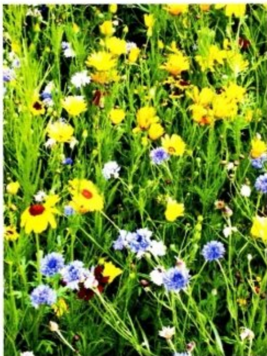
Queen Elizabeth Olympic Park, East London, Olympic Games, London 2012, 5 August Llewelyn Pritchard MA